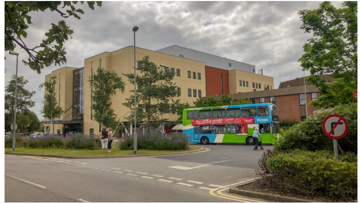
Ipswich Hospital, Bus loop

The Travel Plans have been informed by a series of studies including on and off site car parking, staff travel to work and patient / visitor surveys which have been influential in setting targets and proposals to be taken forward on each site. The latest surveys indicate that there has been a reduction in private car use across both hospital sites, which shows a positive shift towards more sustainable modes of transport.