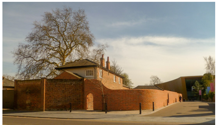
Front view of Grade I listed East Hill House and new boundary wall to Lewis Gardens

For OMC Investments Ltd (OMCI), LPP secured planning, listed building and scheduled monument consent for new boundary walling, landscaping and car parking on a former derelict area of land purchased from the Borough Council.