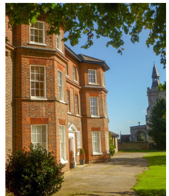
Rear view of East Hill House

This prominent location lies adjacent to OMCI's Grade I listed East Hill House, close to the Town Centre, and has made an important contribution to the enhancement and regeneration of the surrounding Conservation Area and Cultural Quarter. It also forms a further part of OMCI's phased renovation and re-use of East Hill house and grounds.