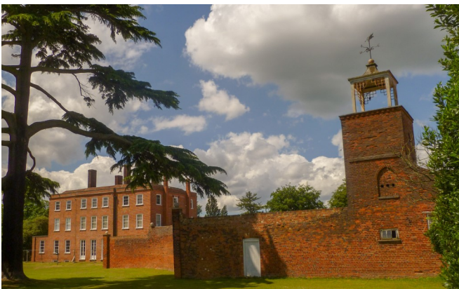
Rear view of Dytechleys, boundary walling and Clock Tower

LPP has secured planning permission and listed building consent for a high quality conversion scheme related to a Grade II listed building known as Dytechleys located in Brentwood, Essex.