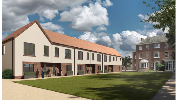
Rear view of Grade II listed 131 High Street

Acting for Mid Suffolk DC as landowner, the permissions will enable the Council to deliver on its objectives to regenerate a key site in Needham Market's High Street, providing a mix of market and affordable homes, along with a new 'anchor' convenience foodstore contributing to the vitality and viability of the Town Centre.