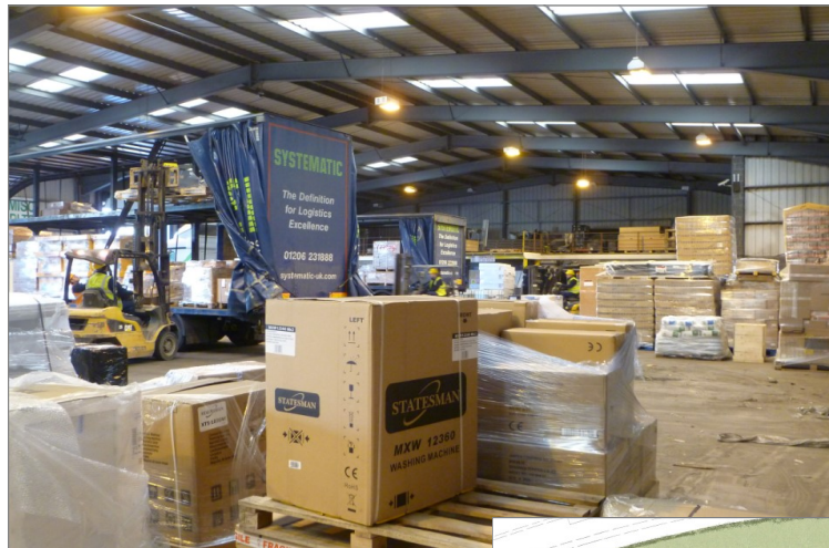
* With thanks to DL Design Services