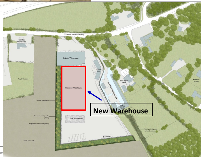
*With thanks to Wynne-Williams Associates