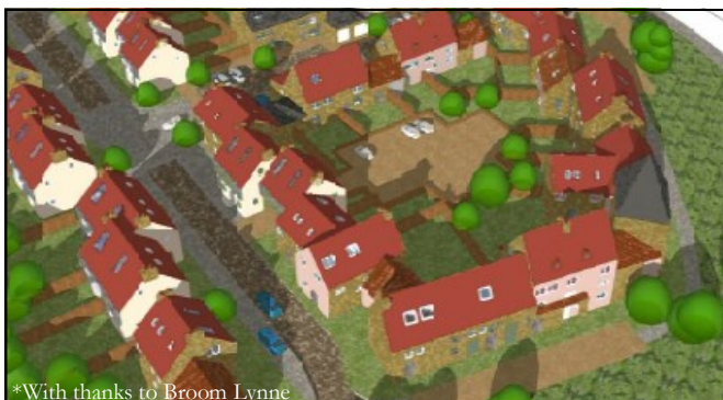
Indicative Masterplan Model

LPP has recently submitted an outline application for the redevelopment of part of the former Blue Circle Sports and Social Club, London Road, Grays, on behalf of the Carver Brothers for residential purposes. The proposals envisage the redevelopment of the 2.3ha site for 75 dwellings @ 32 units/ ha, providing a mix of 2, 3 and 4 bed apartments, terraced, semi and detached units, along with play areas, open space, wildflower meadow, access, footpath/ cycle track and drainage infrastructure.