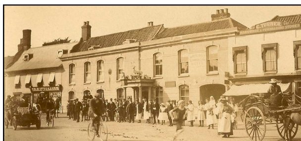
Old Photograph of No.2 Market Place, Hingham

On behalf of Saham Park Investments Ltd, LPP recently obtained planning permission and listed building consent for internal and external alterations, and the change of use from mixed residential and retail use to a single dwellinghouse of a Grade II Listed property located within the centre of Hingham, in Norfolk.