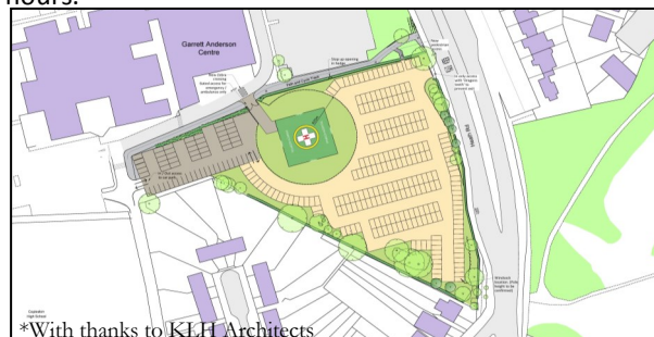
Bridge School Proposed Layout Plan

LPP recently coordinated a public exhibition for a new Helipad and surface car park on land recently acquired by Ipswich Hospital adjacent to the main health campus. The exhibition and consultation event was attended by local residents and other interested parties. Planning applications for the proposals are due to be submitted to Ipswich Council in April. The scheme allows for quicker and more direct patient transfer to the Emergency Department and would enable critically ill patients to be received by helicopter during darkness hours.