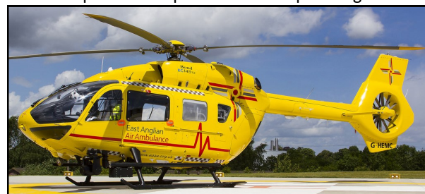
East Anglian Air Ambulance

The additional car parking will provide for further capacity for on-site patient, visitor and staff use pending more comprehensive redevelopment proposals for the wider hospital site as part of a masterplanning exercise.