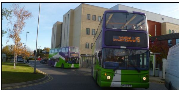
Photograph of bus at Ipswich Hospital

LPP drew up the Travel Plan review after coordinating a series of studies including on and off site car parking and staff travel to work surveys. The latest travel survey indicates that nearly 50% of all staff currently commute to work by non-car modes, another indication of how successful the travel planning exercise has been.