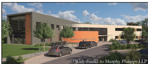
CGI of Main Approach to Health Centre

For West Suffolk CCG and NHS Property Services, LPP has secured approval for the Staff Travel Plan, an occupational requirement of the planning permission granted by Babergh DC following the opening of the new building in 2015.