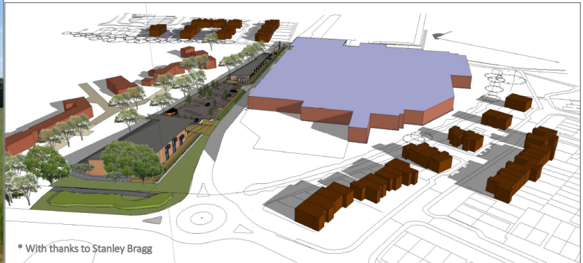
* With thanks to Stanley Bragg